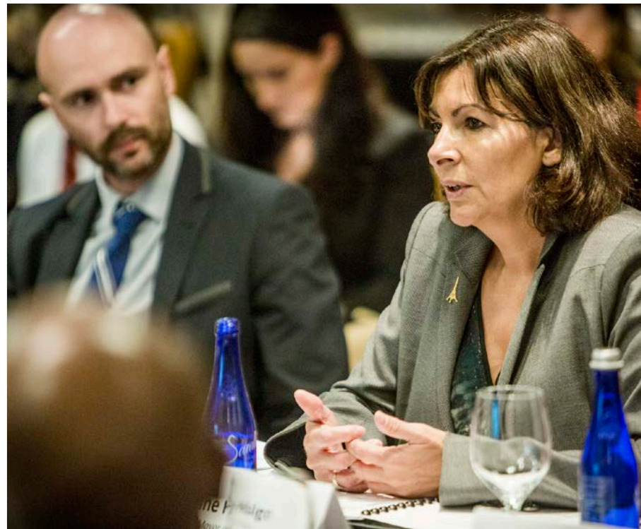
C40 CHAIR MAYOR OF PARIS, ANNE HIDALGO

C40 helps city leaders help each other to deliver climate action and raise collective ambition